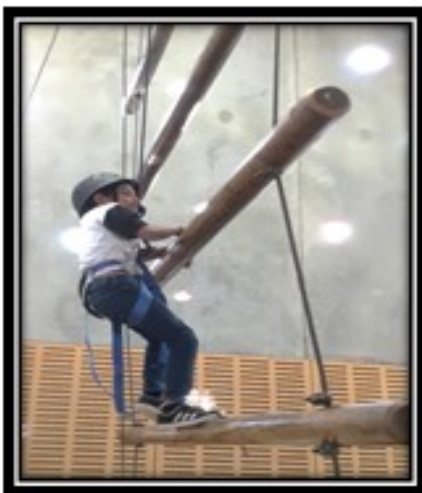
Indoor vertical challenge

95 students from Year 3 and 4 went to Berry Sport and Recreation Centre for a 3 day - two night camp in Week 6. Two buses left MFPS at 9am and we arrived in Berry at 10.30am. Luckily no one was sick on the bus and we enjoyed our bus trip especially the views of the water as we passed Wollongong and Kiama. On arrival, we were introduced to our group leaders and had a delicious lunch. There was a huge area for free play and lots and lots of equipment, including a basketball court, tennis court and ping pong table. Over the three days, we participated in activities such as archery, the dark maze, indoor vertical challenge, cable glide and cook out, where we built a fire and cooked damper. Everyone had a fantastic time and we were very lucky with the amazing weather. All of the group leaders commented on our outstanding behaviour and willingness to participate in activities even if they were outside our comfort zones. The cooperation, team work and problem solving skills, while participating in the activities, amazed everyone. We could not be prouder of the students who attended the Stage 2 Berry Camp.