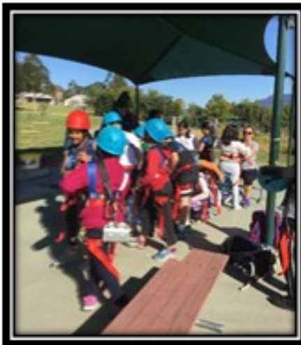
Cable glide/ zip line