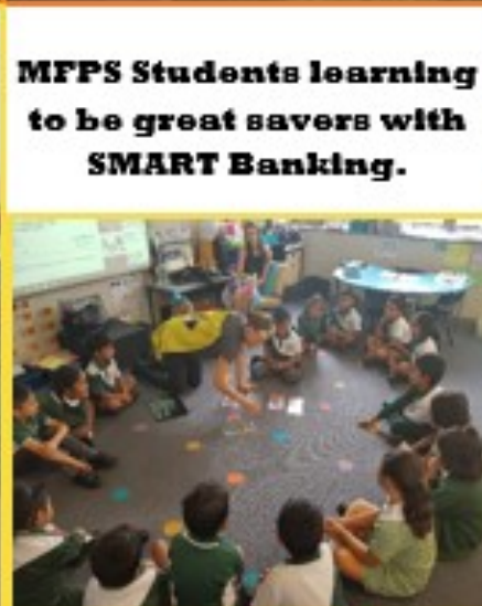
MFPS Students learning to be great savers with SMART Banking.