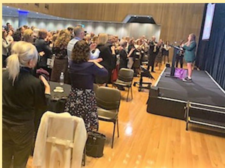
Destiny delivering the Acknowledgement of Country